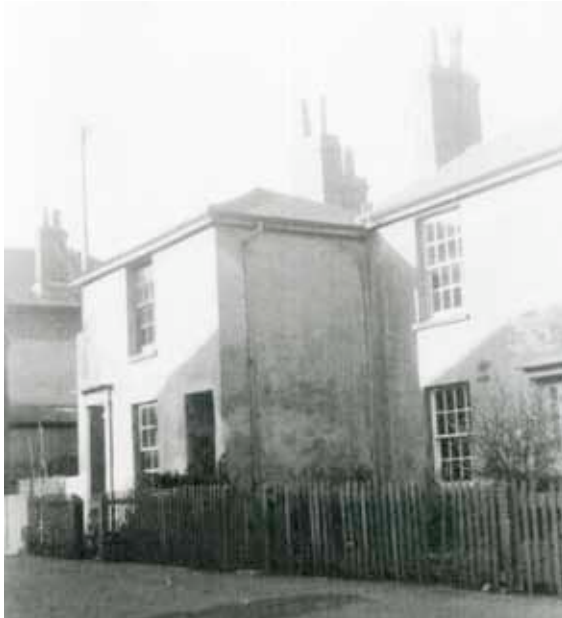
The Old Alms Houses in the High Street