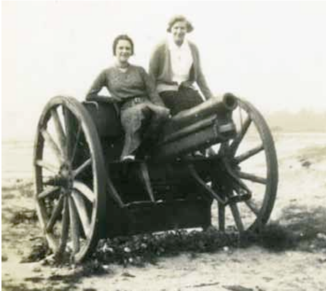
A First World War field gun on the beach at Bembridge during the 1920s & 1930s